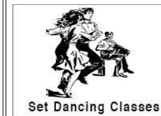
Set Dancing Classes

Opening School Year Mass will be celebrated in Kilmurry on October 10th at 11.15. All are welcome.